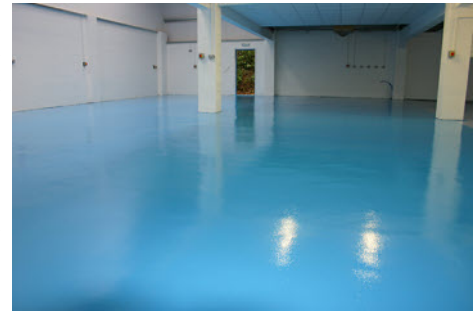
CONSEAL TSF is ideal for use in food factories and other situations where a odour free coating is required.